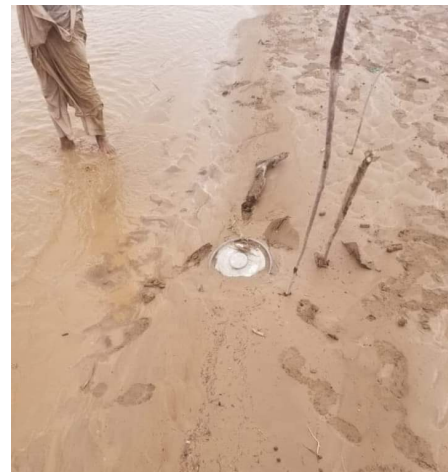
A landmine planted in sandy soil and moved by the recent floods in southern Hudaydah.

The Mission also facilitated discussions on coordination and access with INGOs in Aden and collaboration on risk education projects with agencies working in Hudaydah.