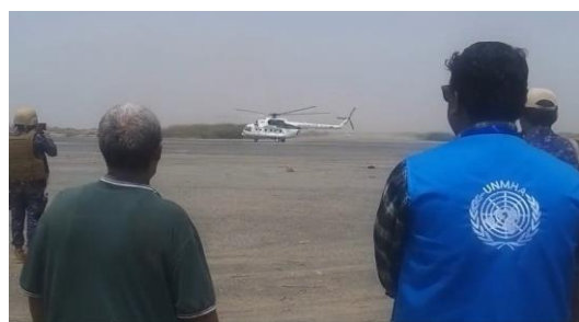
On 6 June, UNMHA assessed that the Hudaydah International Airport apron area was free from explosive hazards (L), allowing the UNMHA helicopter to land on 7 June (R).