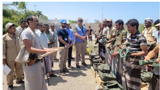
UNMHA visited the YEMAC deminer training in Hudaydah city.