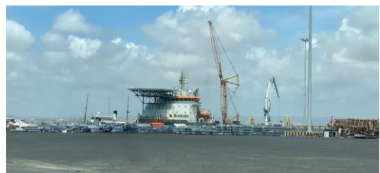
UNMHA Mine Action Advisor coordinated risk mitigation and security briefings to FSO Safer project crew member on a vessel in Djibouti

On 17 May , UNMHA supported the FSO Safer project in a field visit to Ras Issa port, providing technical advice on landmine and ERW risks in the visited area, onshore from the FSO Safer oil tanker. On 18 May , UNMHA visited a YEMAC training for deminers in Hudaydah city to observe training standards and the use of new equipment. On 24 May , on behalf of the Resident Coordinator's Office (RCO), UNMHA Mine Action Advisor travelled to Djibouti to coordinate risk mitigation and security briefings to project crew onboard the FSO Safer support vessel. On 29 May in Sana'a, UNMHA met with the RCO and discussed the RC's strategy for mine action in Yemen. From 30 to 31 May in Aden, the Deputy Head of Mission met and discussed mine action implementation and coordination with INGOs, including Project Masam, ICRC, Norwegian People's Aid, the Halo Trust, and the YMACC.