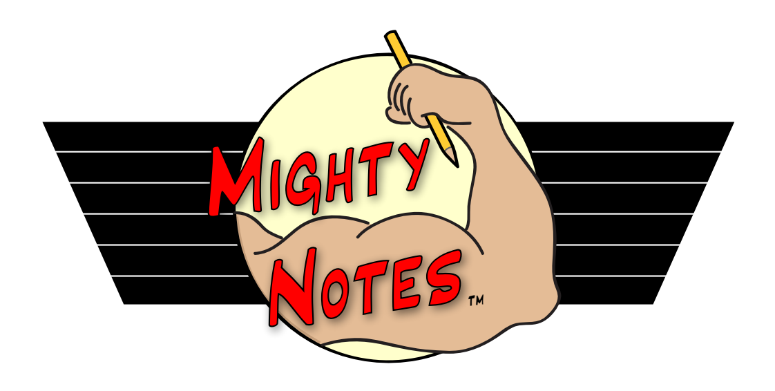
POWER TO THE PENCIL!