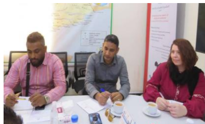
UNMHA attending a programme manager meeting, led by YMACC, and attended by NGO representatives in Aden