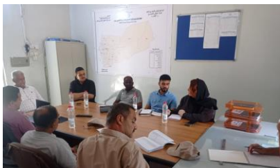
UNMHA conducted a visit to YEMAC to discuss mine action support and implementation

In October 2023, UNMHA conducted 19 mine action coordination activities with 15 interlocutors including UN partners, local authorities, NGOs, and the private sector on advocacy, resource mobilization, and risk assessment. UNMHA continues to advocate for increased support to the mine action sector in Yemen.